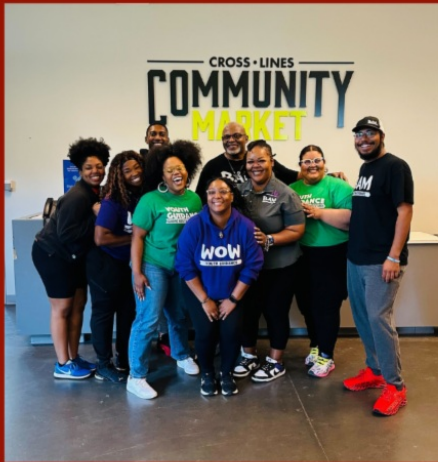
Youth Guidance in the Market